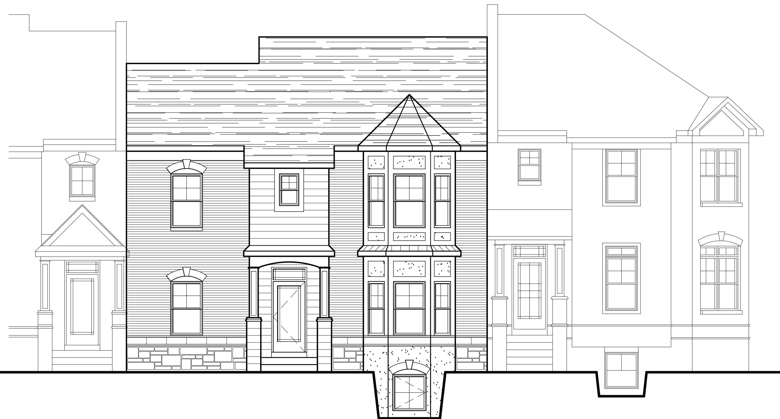
CLAY AVENUE ELEVATION 3/16" = 1'-0"